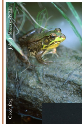
Green frog