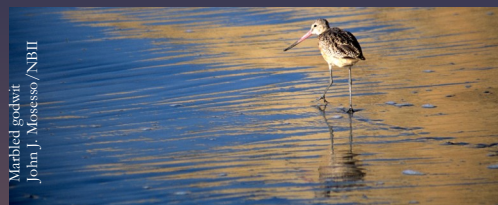
Marbled godwit