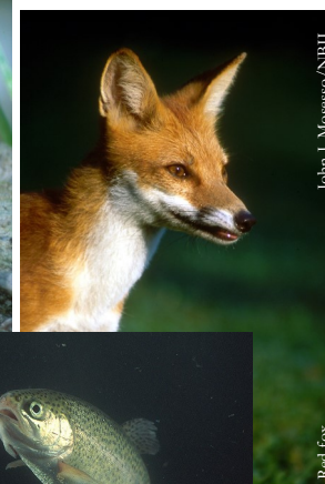
Red fox