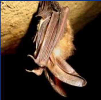
Bat-Virginia Big Eared Bat