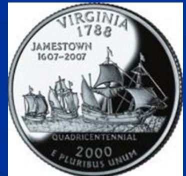
State Nickname- "Old Dominion"