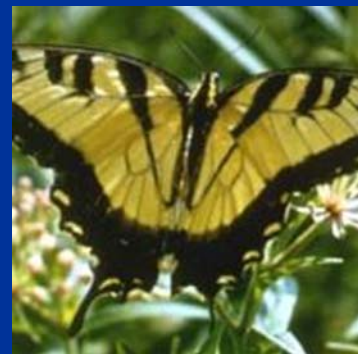
Insect- Tiger Swallowtail Butterfly