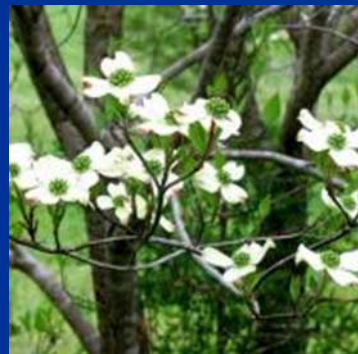
Floral Emblem- American Dogwood