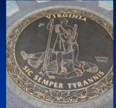
Sic Semper Tyrannis Virginia's official state motto (Thus Always to Tyrants).