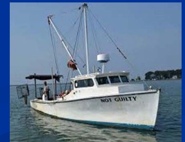
Boat-Chesapeake Bay Deadrise