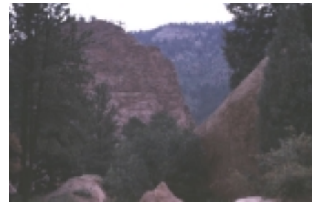
Pike National Forest

A Special Thanks!!! The Program Committee would also like to extend special thanks to the agencies and businesses that support the conference through their donations of raffle items: ESRI-Boulder (numerous copies of GIS in Natural Resources and Serving Maps on the Internet), Colorado Division of Wildlife (shirts and wildlife videos), Pacific States Marine Fisheries Commission (shirts and caps), and Virginia Department of Game and Inland Fisheries (shirts and wildlife print).