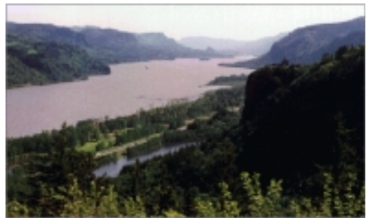
Columbia River Gorge

OFWIM 2001 will be held at the DoubleTree Hotel-Columbia River right along the Columbia River. Special conference room rates have already been secured for attendees. More information about rates, reservation deadlines, and reservation procedures can be found on the OFWIM web site at www.ofwim.org/ofwim2001.html . Outstanding field trips will be available for those arriving to Portland early—check the web site