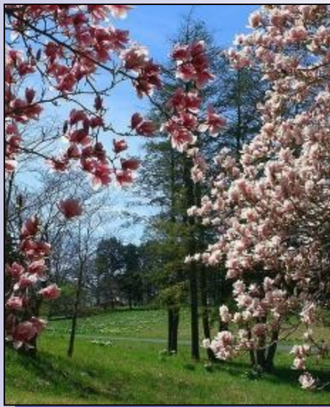
Shaw Nature Reserve