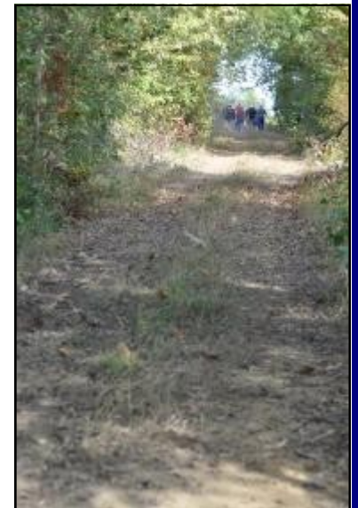
Duck Island Trail