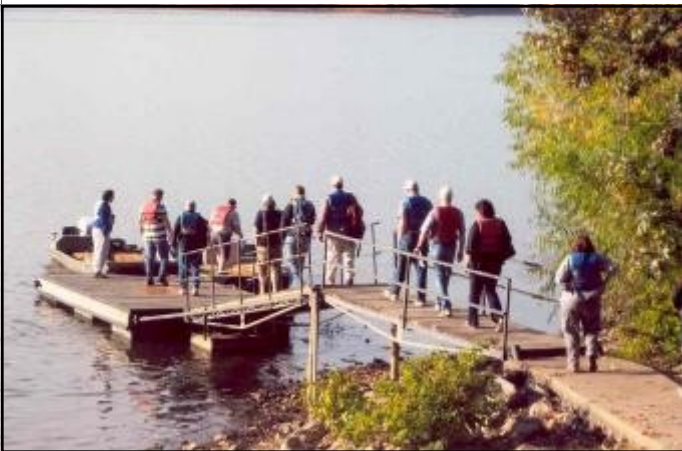
The group loads up on boats to head over to Duck Island.