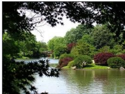
Missouri Botanical Gardens