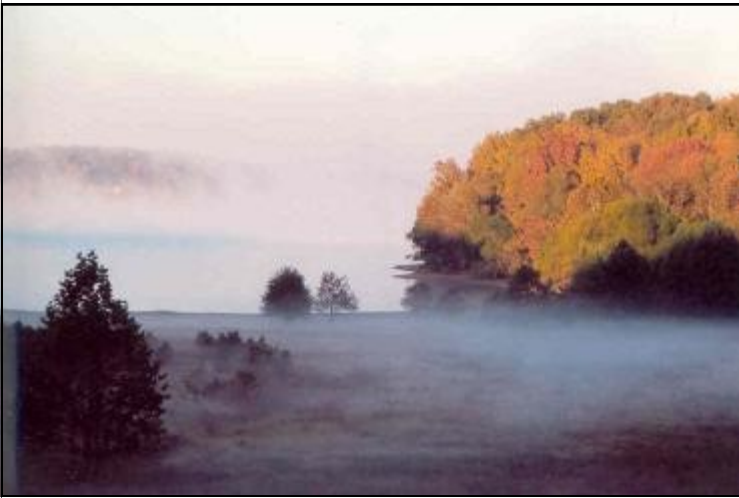
Scenic shot of Lake Barkley.