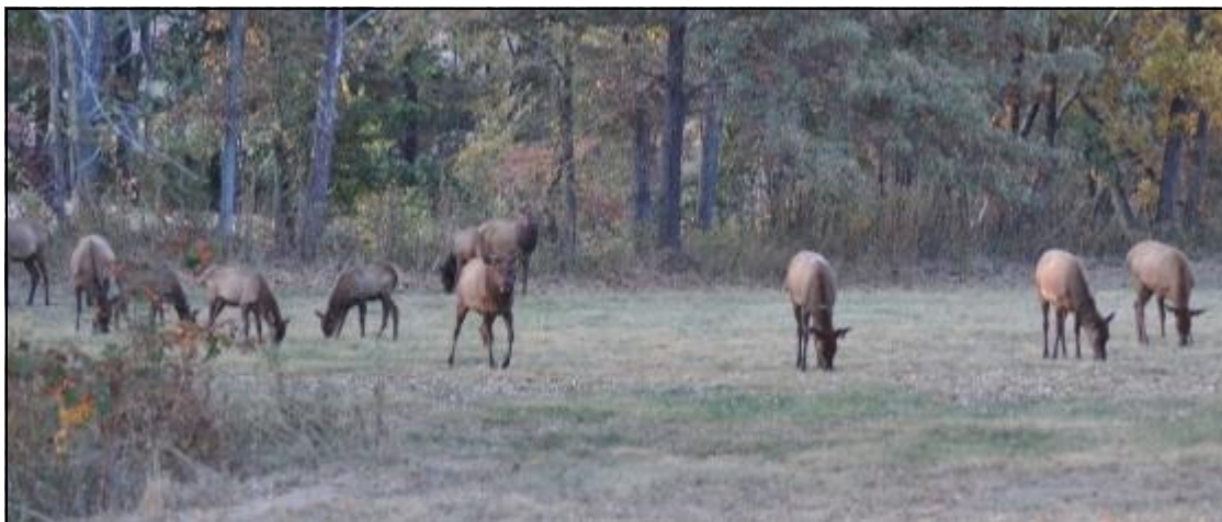
Multiple elk provide picturesque photo shoot for excited visitors to the Elk and Bison Prairie at LBL.